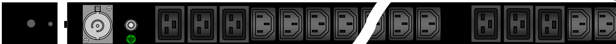
4 Position End Bracket Location Pip & M5 Screw Fixing. Each End

Provided with with 3 metre lead 3x4.0mm 2 HO7 Cable Neutrik 32Amp to IEC309 32Amp Commando Part Number IPL-PL32/3. Other lengths and terminations are available.